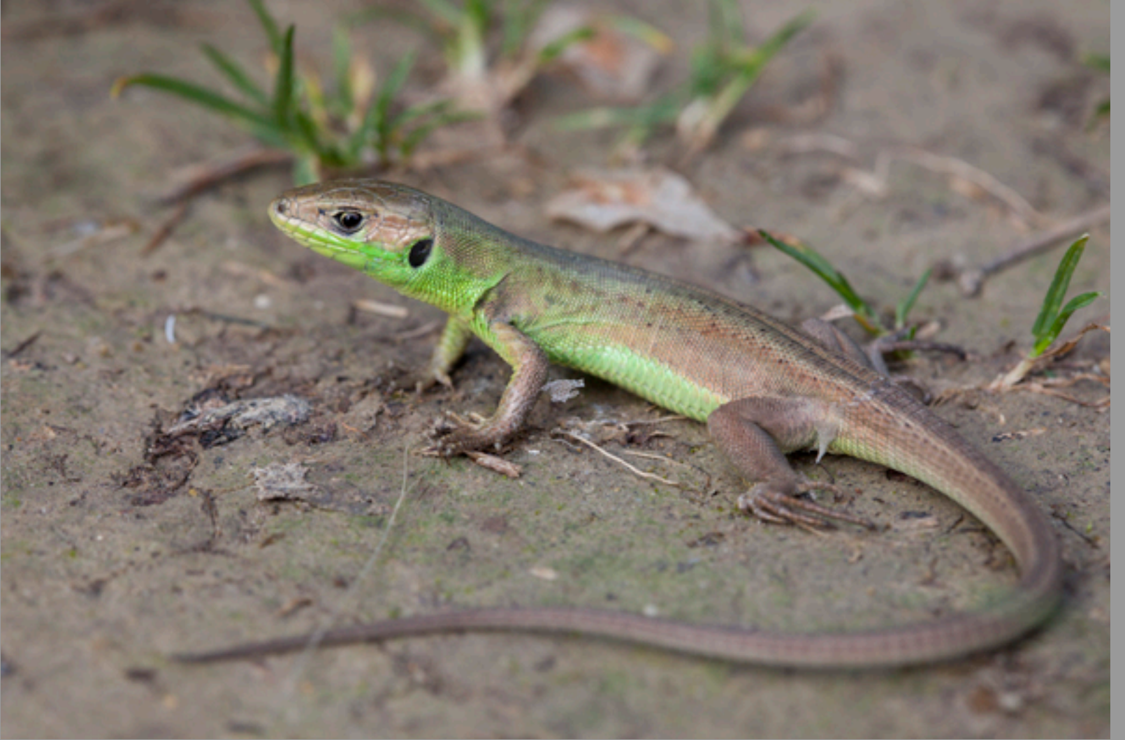
Bombina variegata variegata