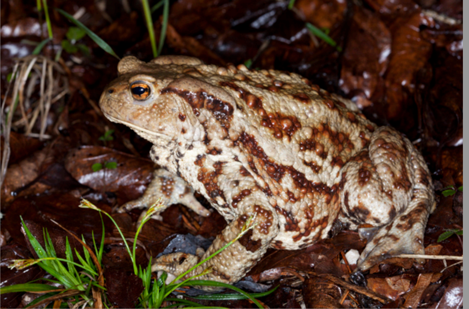
Natrix natrix natrix with split necklace