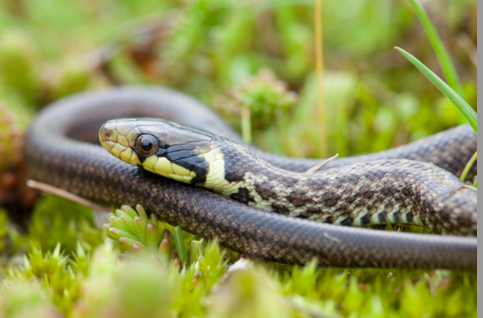
Bombina variegata variegata