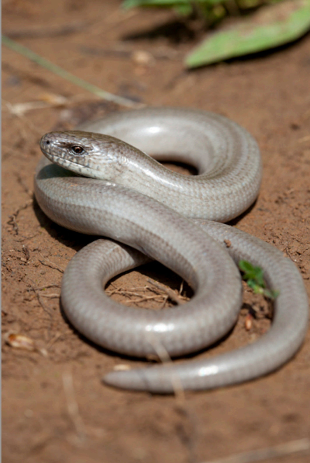
Vipera ammodytes ammodytes