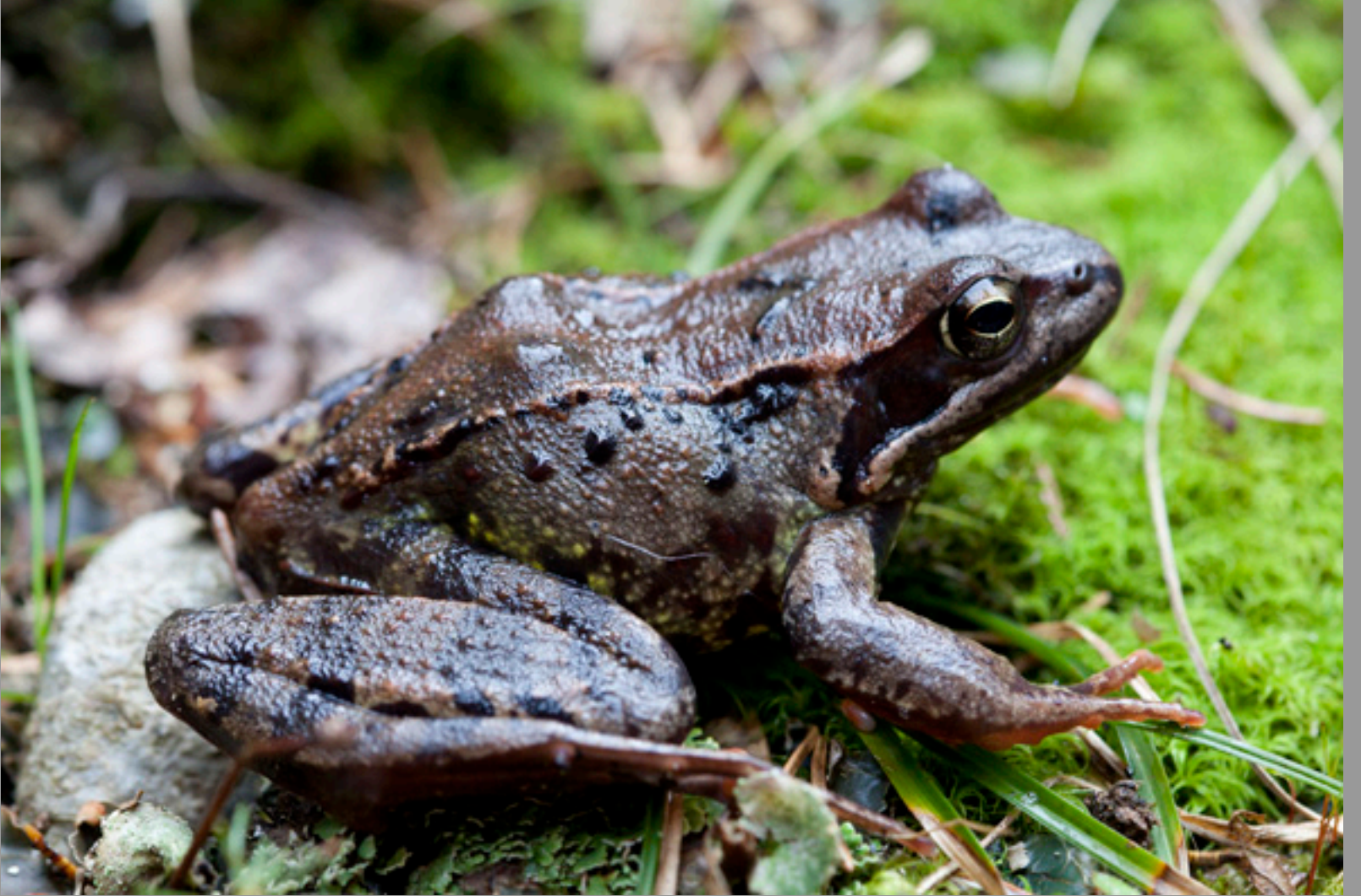
Ichthyosaura alpestris alpestris , male