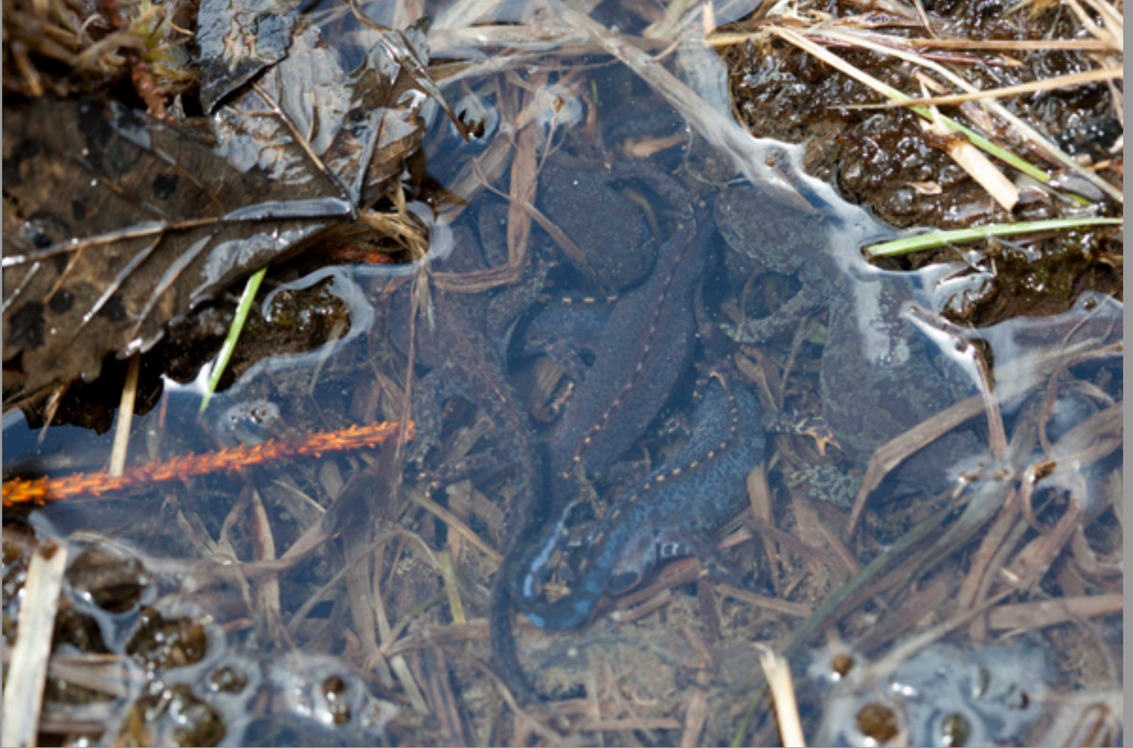
a female and Rana temporaria eggs