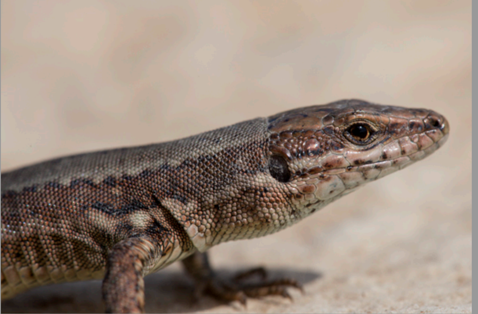
a flashy Lacerta bilineata male