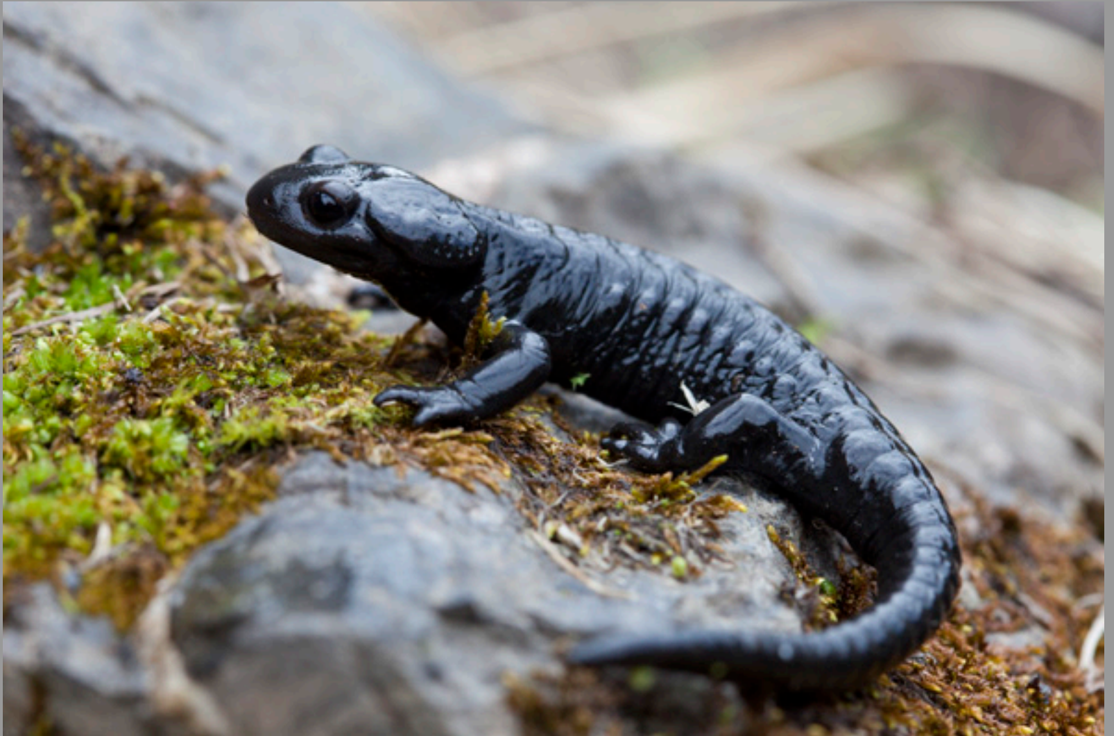
Salamandra atra atra

Next, on the bank of the Lac Léman, I failed to find any Natrix tessellata on a known spot. Finally, close to the border with France, I found a Zootoca vivipara vivipara but no Vipera berus .