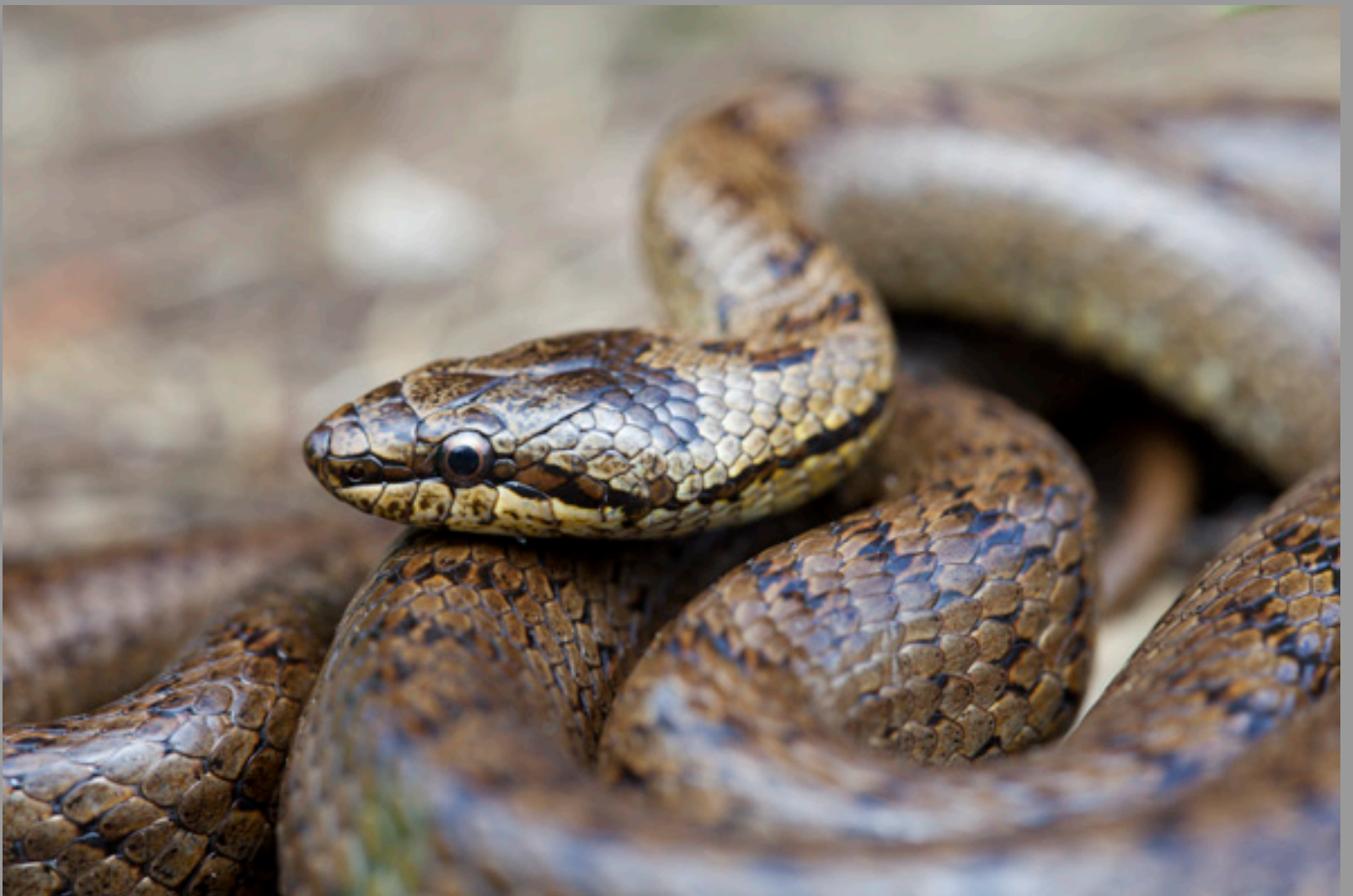
Near Bex (Switzerland)

I went alone in the Swiss mountains to make pictures of Salamandra atra atra . I found quickly several Salamandra , adult, subadult and young. Ichthyosaura alpestris alpestris was everywhere, under stones and in a cold pond made by the molten snow. Also a Rana temporaria .