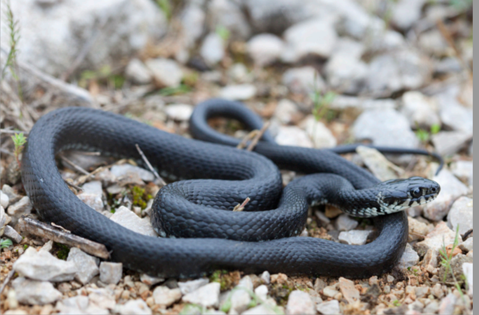
Bufo viridis (viridis ?)