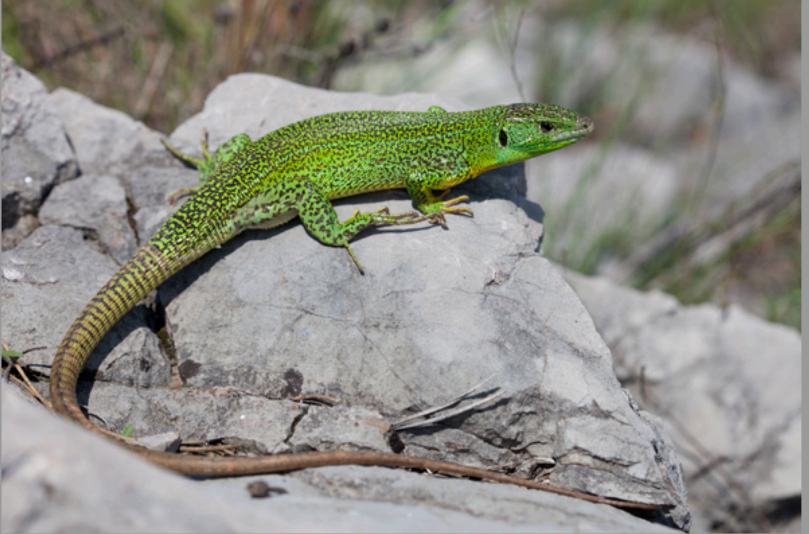
a young one