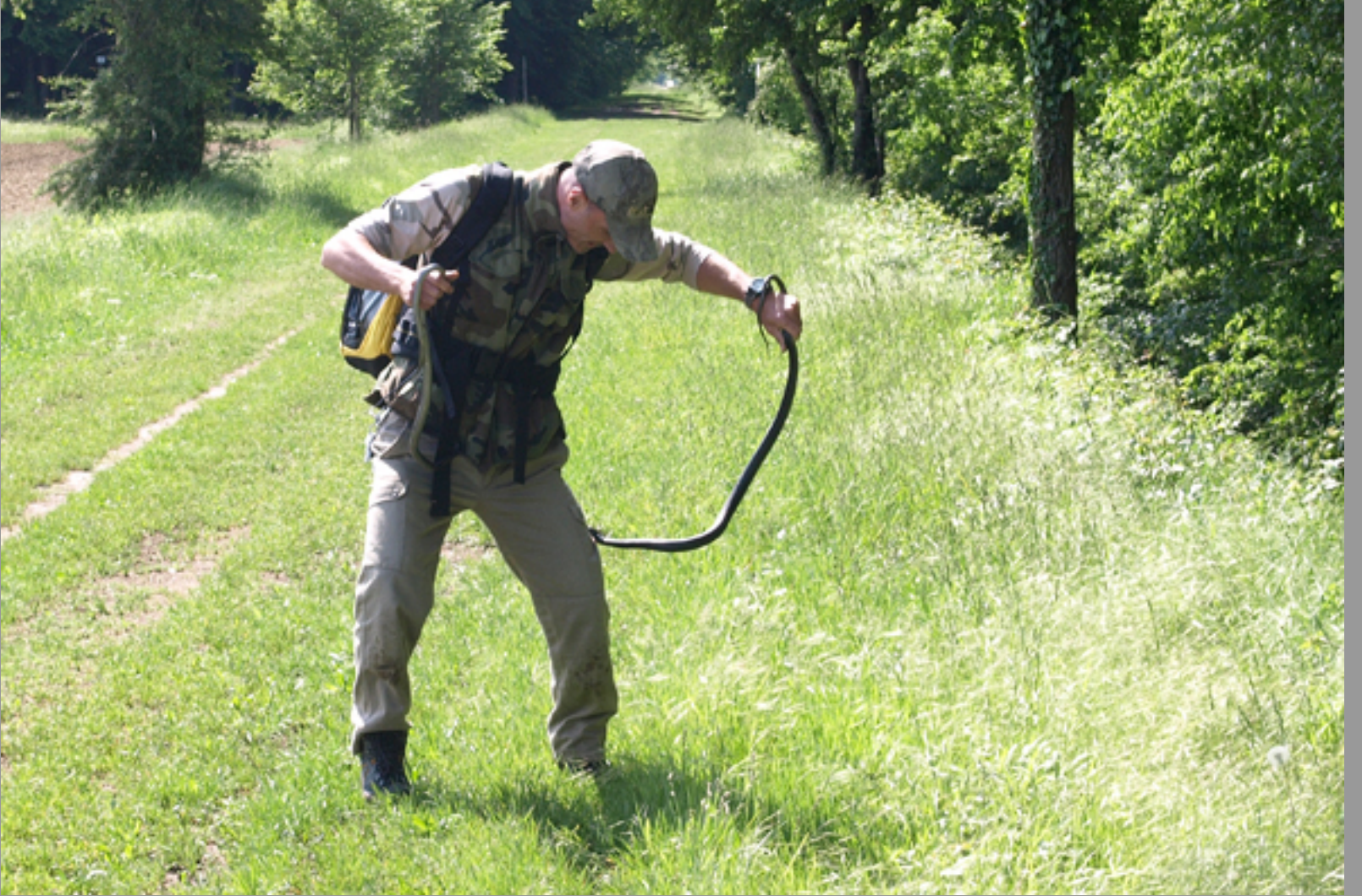
Natrix natrix persa