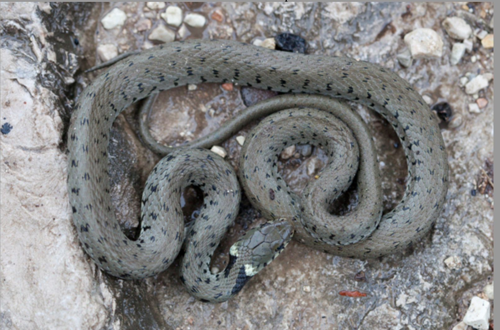
Near Venezia (N Italy)

By a sunny day, we found several Hierophis viridiflavus carbonarius , some nice Natrix natrix persa , Pelophylax esculenta , Pelophylax lessonae , Hyla intermedia , Emys orbicularis hellenica and Lissotriton vulgaris meridionalis . Also a single Bufo viridis viridis and some Podarcis muralis