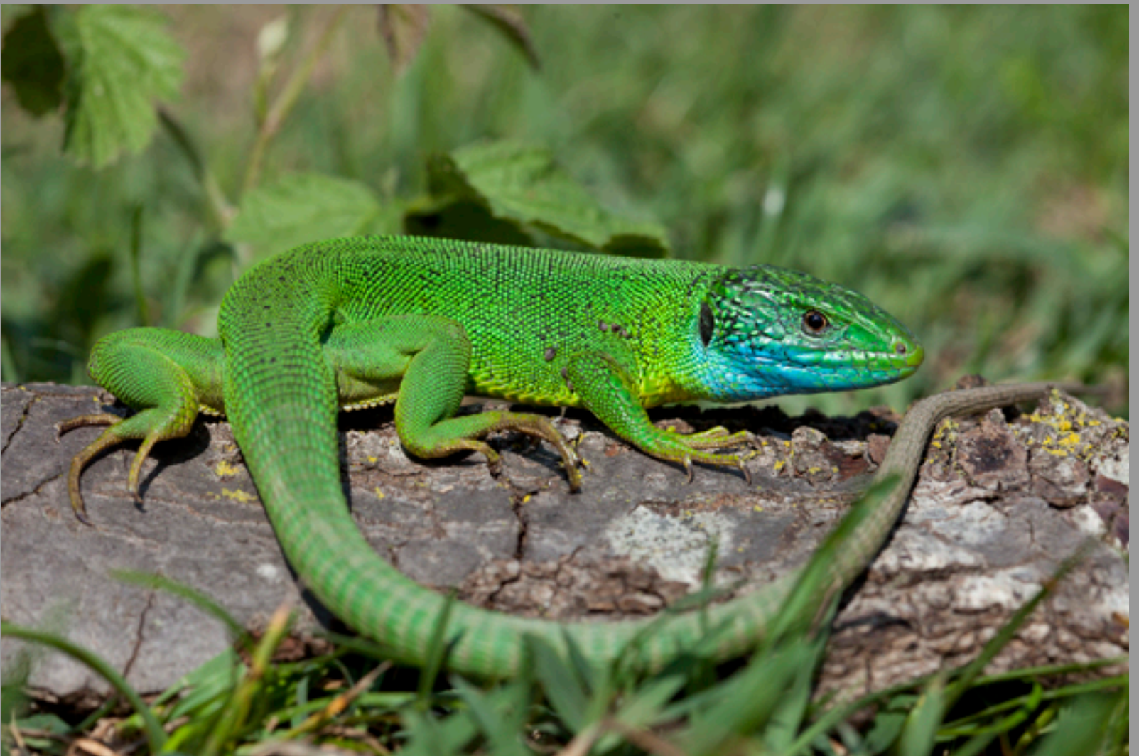
Lacerta bilineata , young