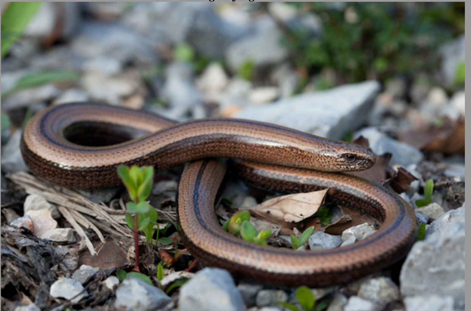
Near Plitvice (Croatia)

In the dark, by a bad weather, we found a huge and gravid female of Salamandra salamandra salamandra on a small road. But further investigations the next day in the same place gave no result.