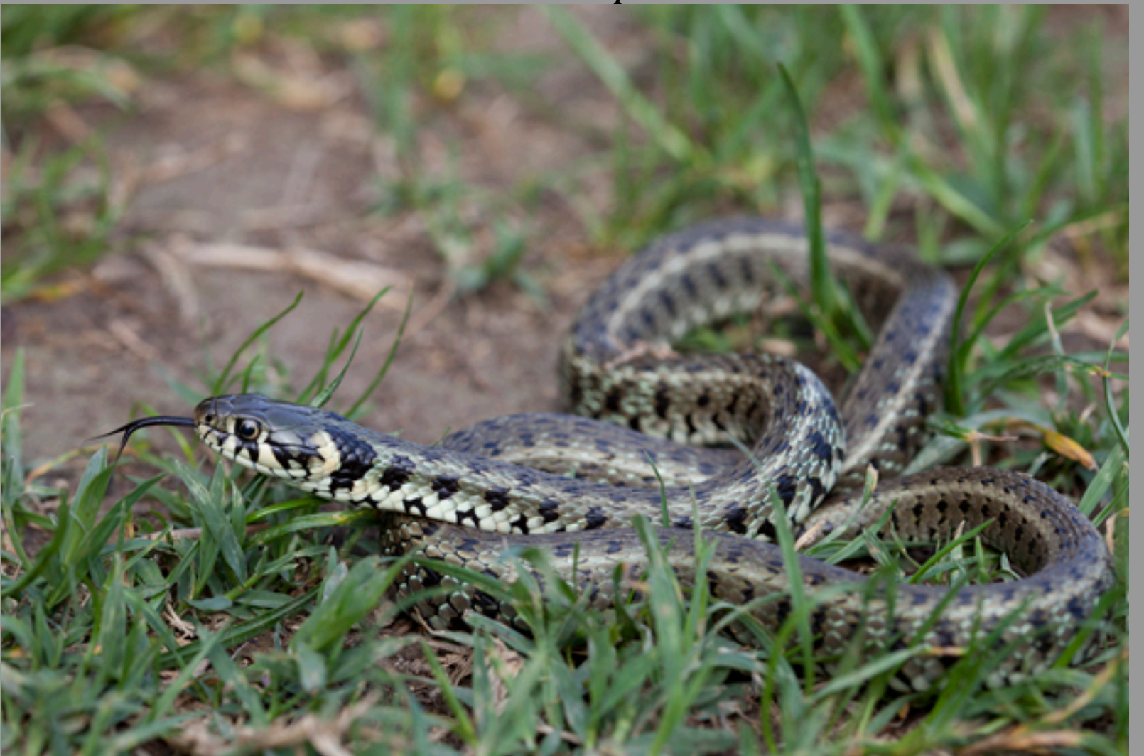
Natrix natrix persa , young crushed