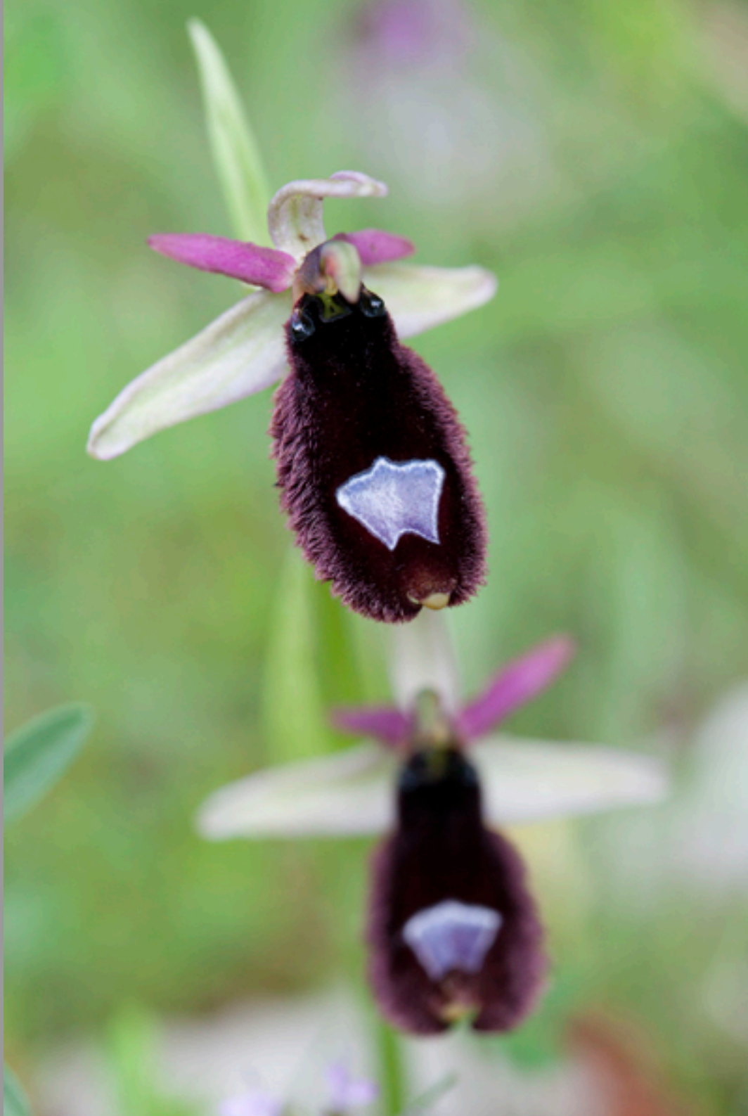
North of Krk...