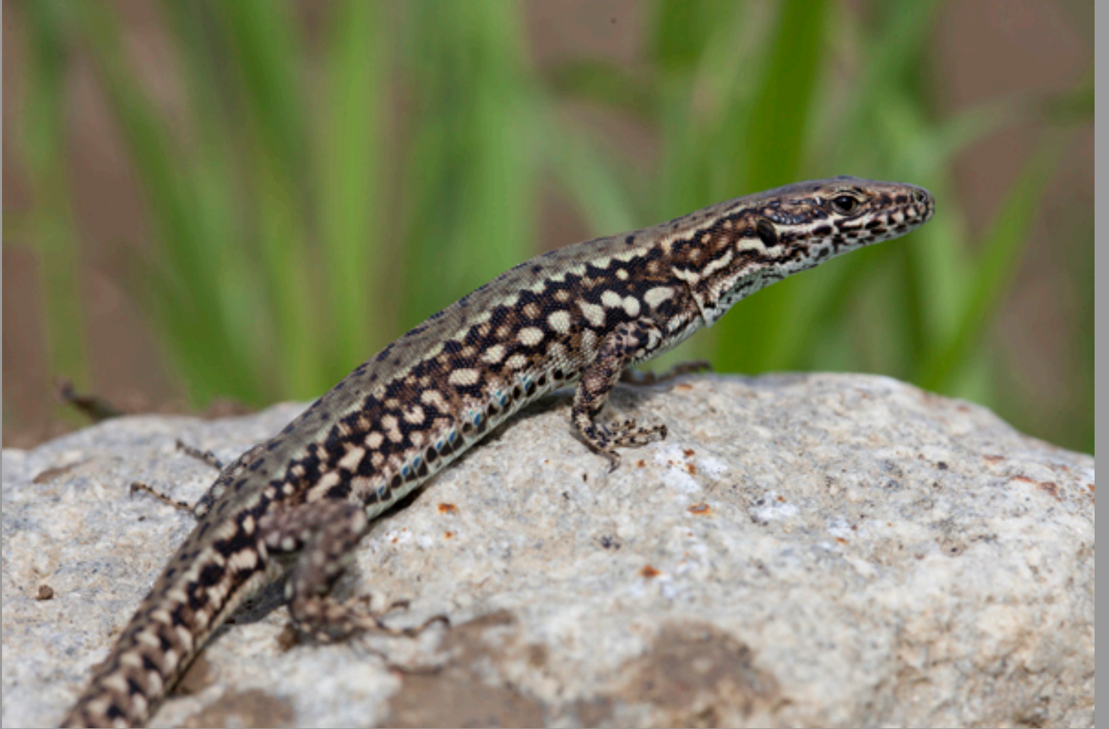
Lissotriton vulgaris meridionalis , male