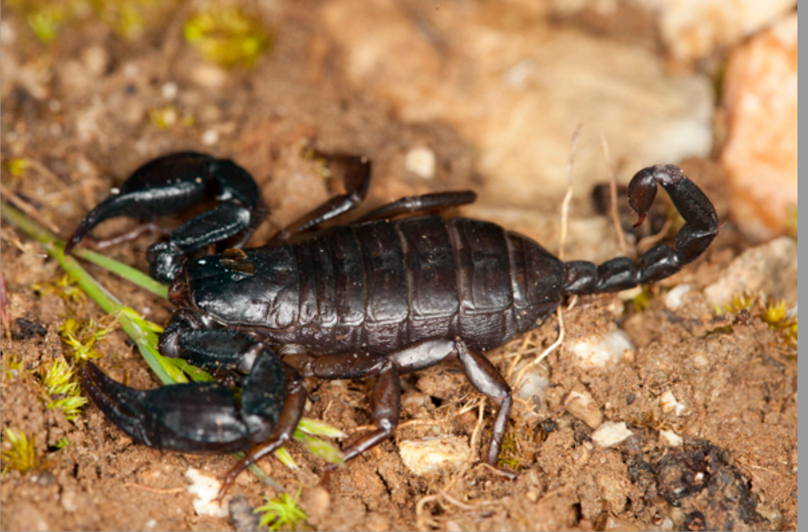
Euscorpius "carpathicus" group