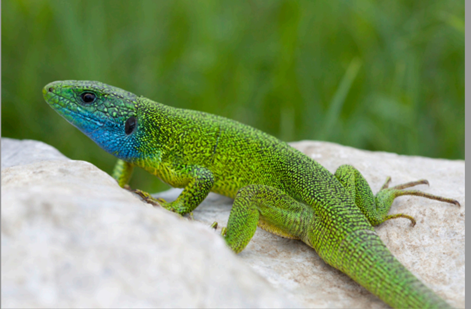
Orchis morio f. alba