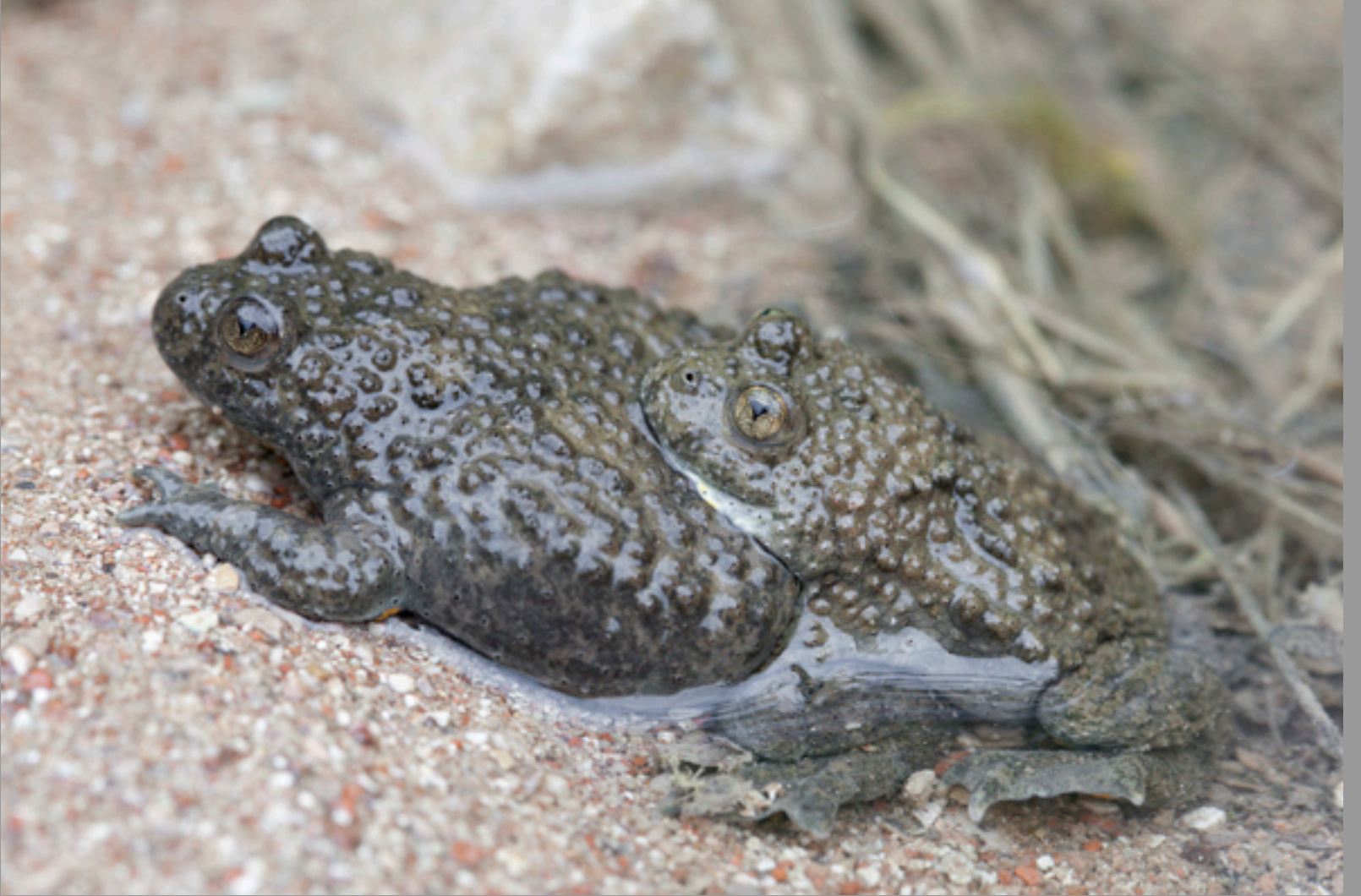
a very young (1 cm)