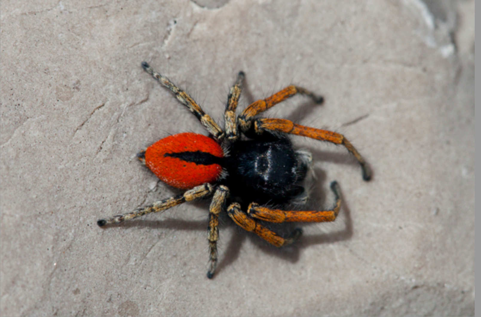
a red Cetonia aurata